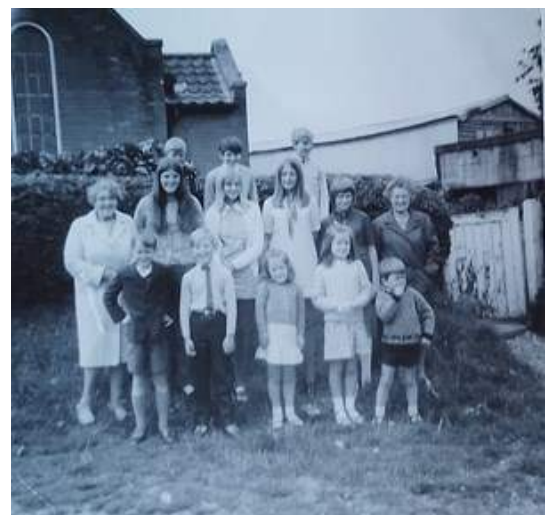
Sunday School 1969