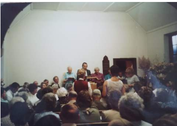
Golden Jubilee 1984

In the evening there was a tea and public meeting in Hindringham Methodist Church.