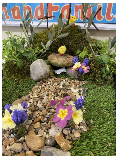
Easter Garden 2026... created by the families at our Lent Mini Messey series, with the stone rolled away on Easter Sunday

BIG TOY GIVEAWAYS ~ we invite families worried about the cost of Christmas gifts to choose from a hall full of preloved toys. We serve festive refreshments and share news of our Christmas events. Families tell us it makes such a difference. We have also been the beneficiaries of toys donated in Tesco and Co-op stores in St Neots. These are shared with local schools for families who they have identified as being in need. Berkley Street is viewed locally as a place where you will find help and support because of our faith.