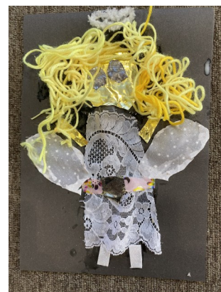
Christmas angel... fabric collage

FOREST CHURCH ~ a new and developing initiative in 2025, on a Saturday afternoon once in each season, because we are passionate about the power of outdoor learning and its contribution to spiritual development. We have been hindered by heatwaves and by rain, but the sessions we have held in Priory Park help families to explore faith together outdoors.