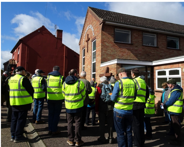
Start of Good Friday procession

and the advertising for it says it includes hot toasties, games, free snacks, crafts, “hang and chat” and more.