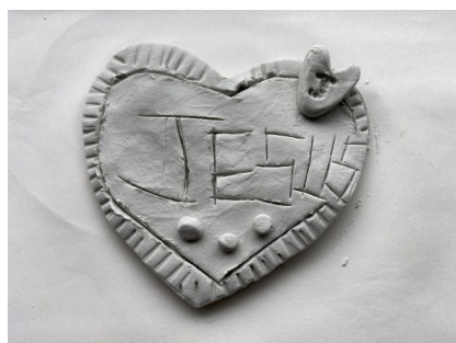
Clay heart... made by one of our Sunday club during a session exploring God's love for us all.

~ has grown from 2 children in 2022 to 15 now! We planned and led the Nativity service recently with dancing, lego created